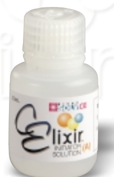
20mL Trial Size Now Available

A Practical Approach to CZE for Practical Scientists